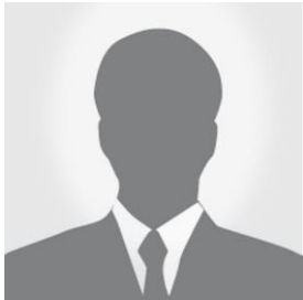
Mr. Altaf Hussain